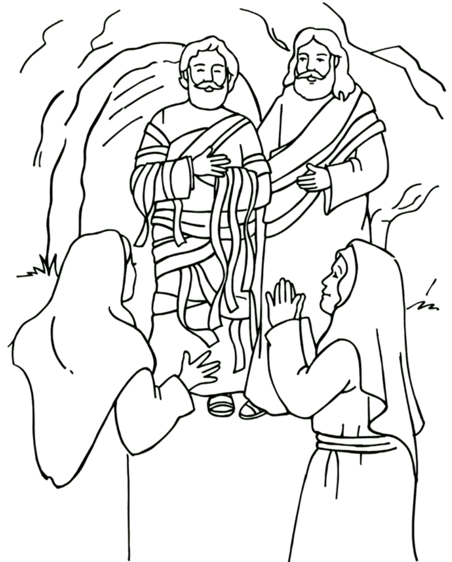
Jesus Raises Lazarus